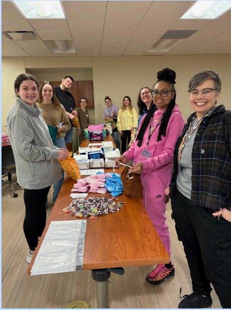
Nazareth University Social Worker Students

Thank you to all of the groups who partner with us on P.A.D. , all of the amazing sewers making bags for us, all of our volunteers, and all of our donors! Here are a few pictures of recent parties held by other organizations.