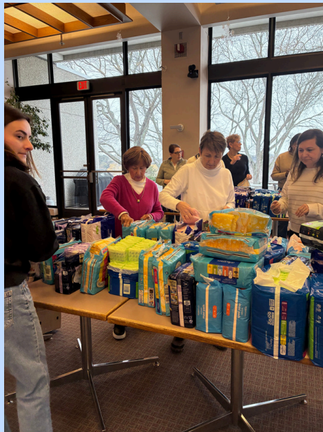
Greater Rochester Association for Women Attorneys (GRAWA), Martin Luther King Day