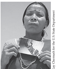
Searching for trafficked daughter

RSVP to Dolores Kleinberg by June 2 at dkberg@rochester.rr.com