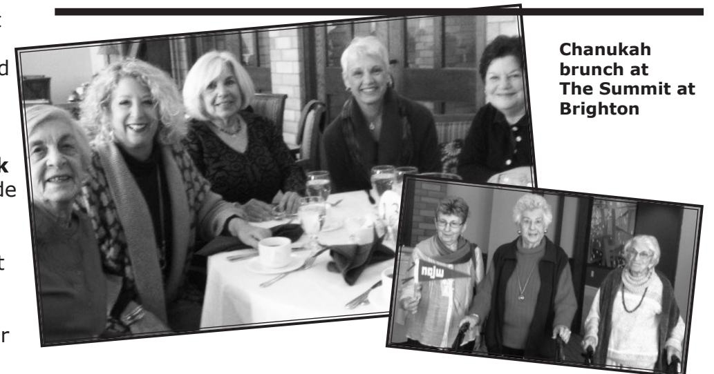
Chanukah brunch at The Summit at Brighton